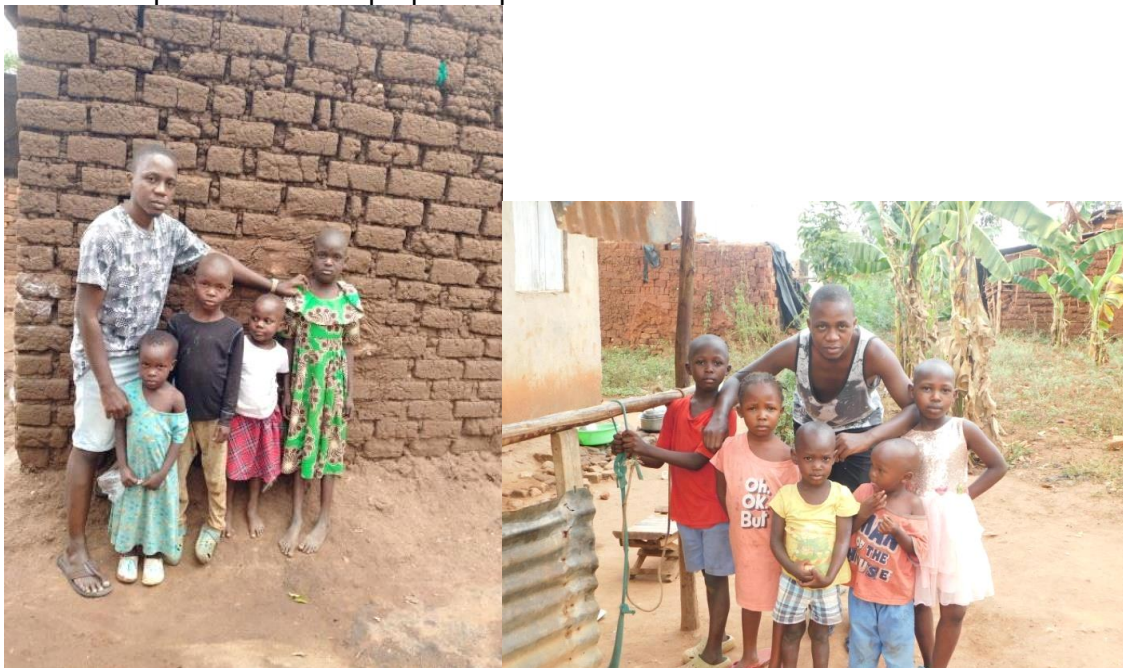
The images above are for some children we have managed to care for and those we are also currently caring for at Child's Life Foundation Uganda.