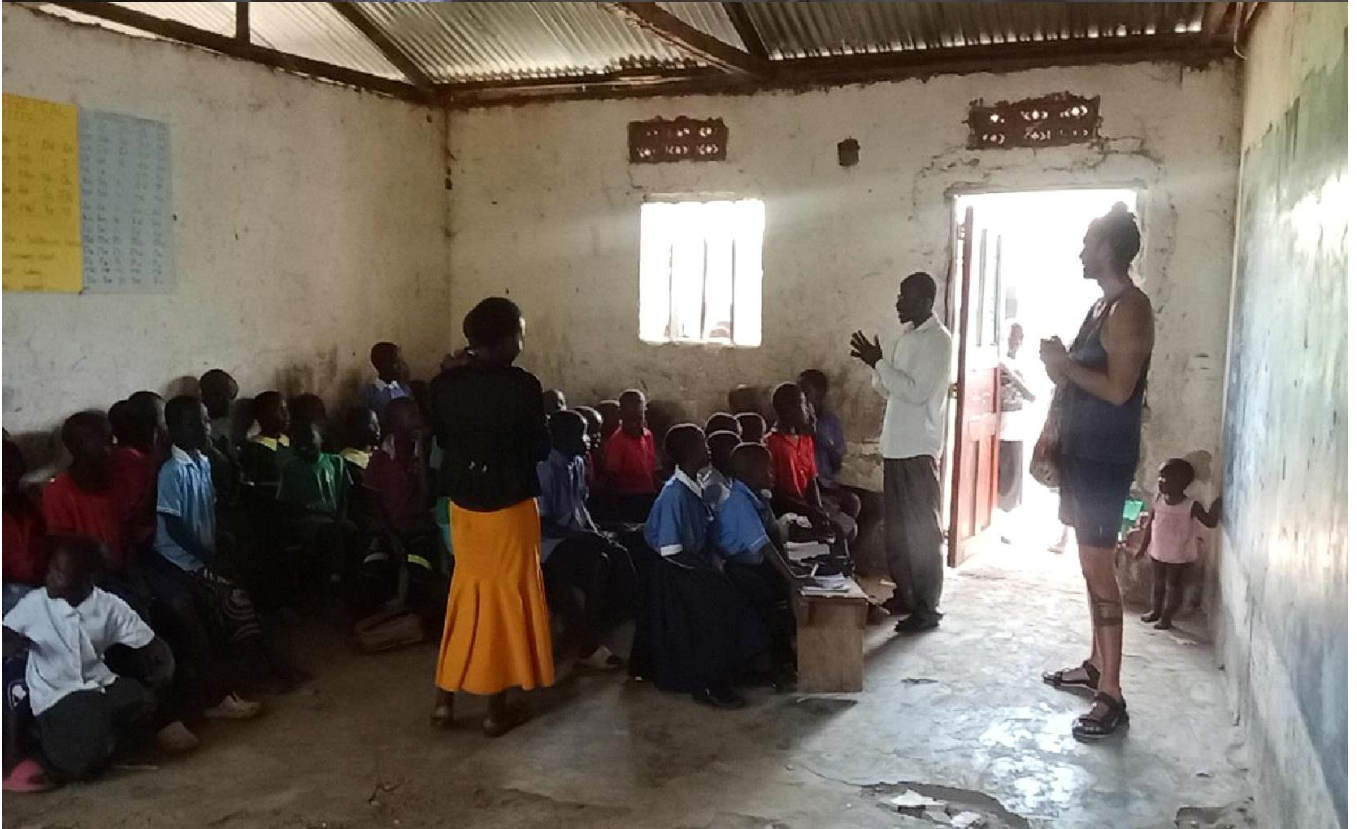
Above are our current different centres where we are managing to educate children from.