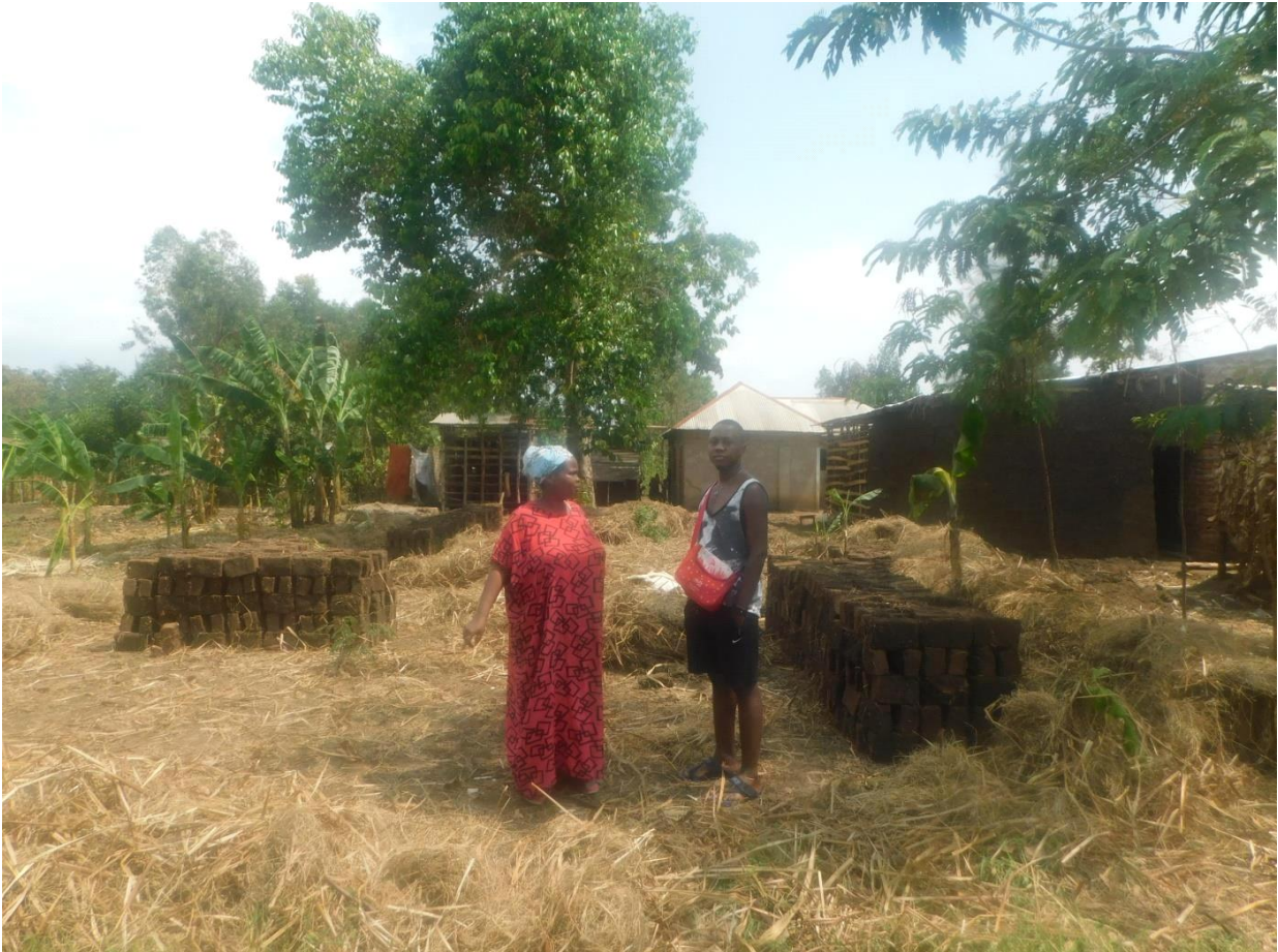
Above the land we have managed to get from different supporters, donors and sponsors and its where we plan to build the proposed plan.