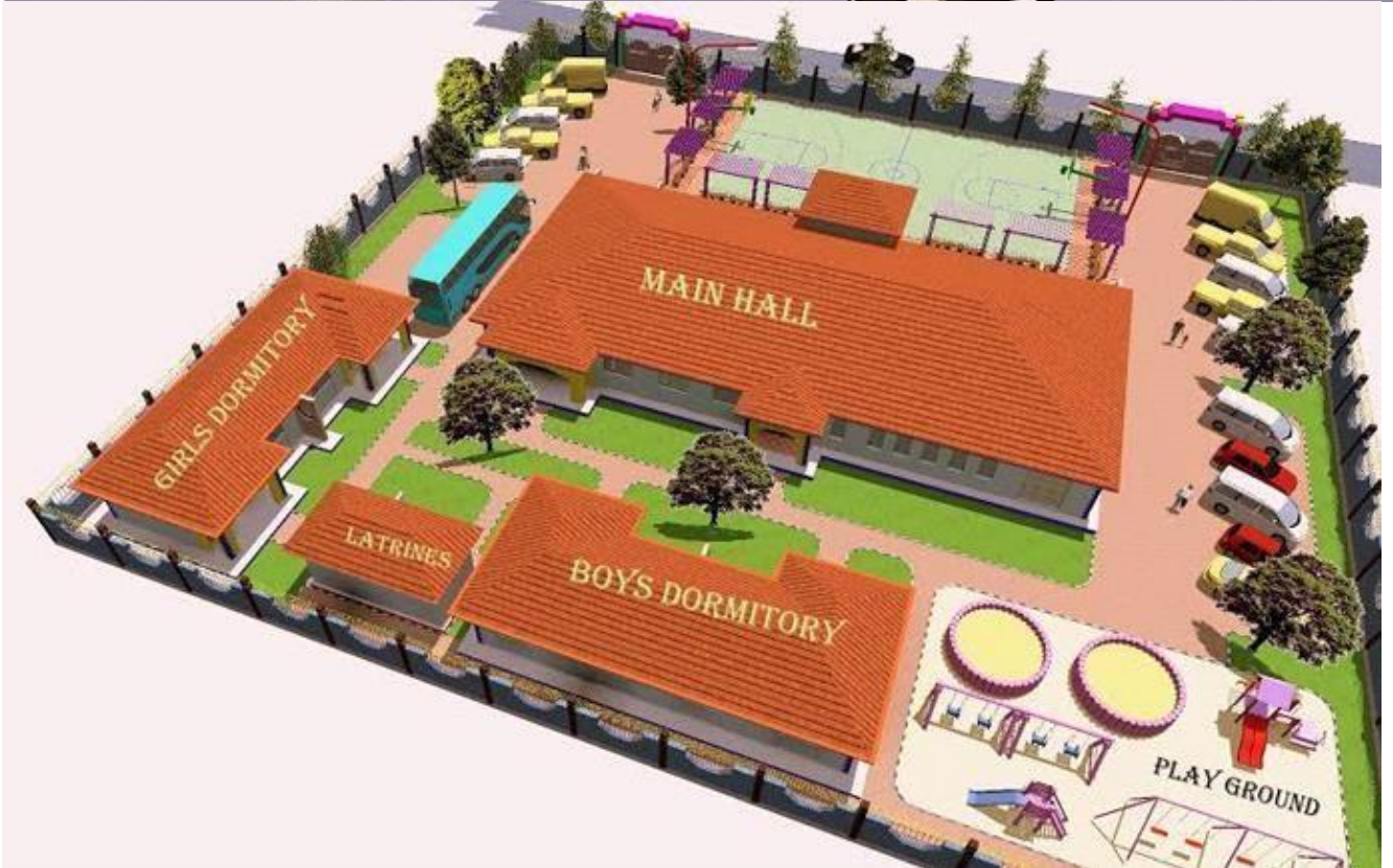
APPENDIX 03: PROPOSED PLAN